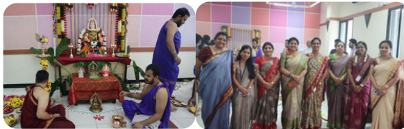
Dasara & Saraswathi Pooja Celebrations