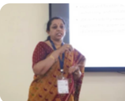
Paper presentation by faculty at various conferences