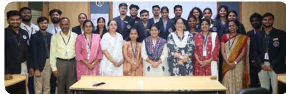
Student Council & Clubs Closure Meet 2025