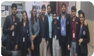
Students attending Finance Quiz @ Jain University