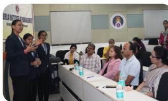
Glimpse of Blitz Ideathon Competition by Rotaract Club